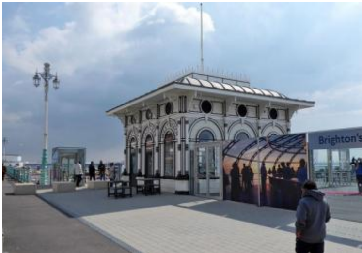
West Beach Bar & Cafe - Street Level Entrance