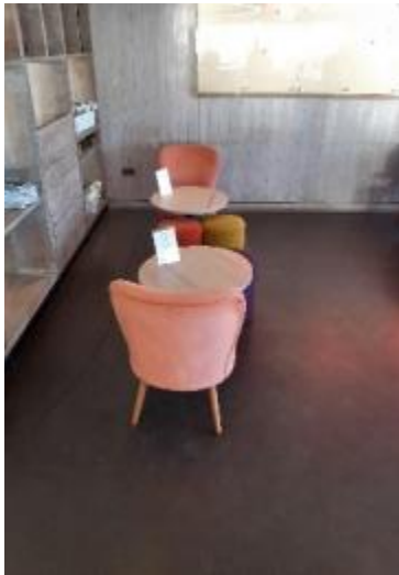
West Beach seating option