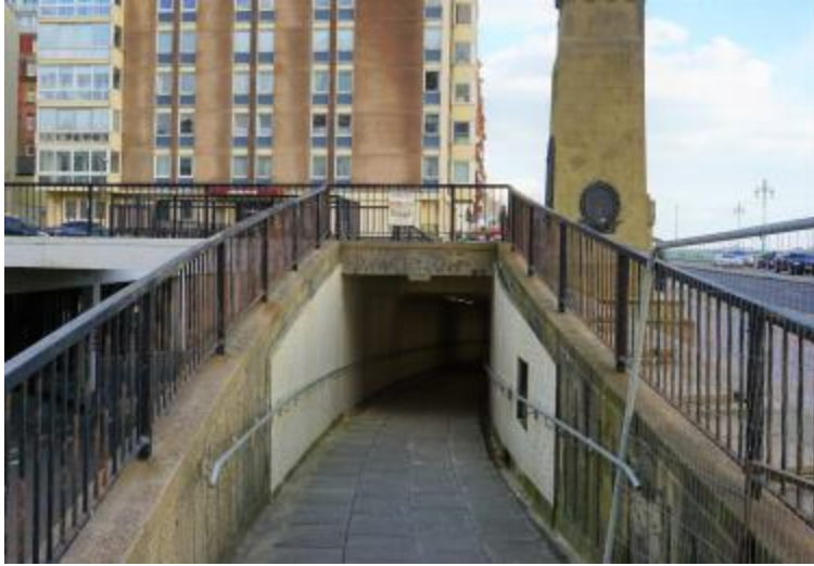
Regency Car Park ramp on street level