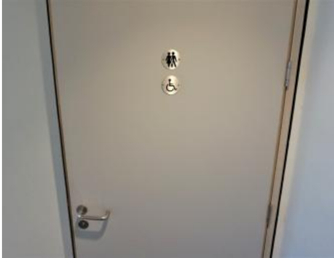
Disabled toilet door