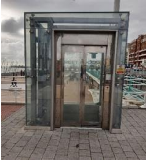
Lift street level