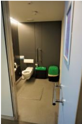
View of disabled toilet