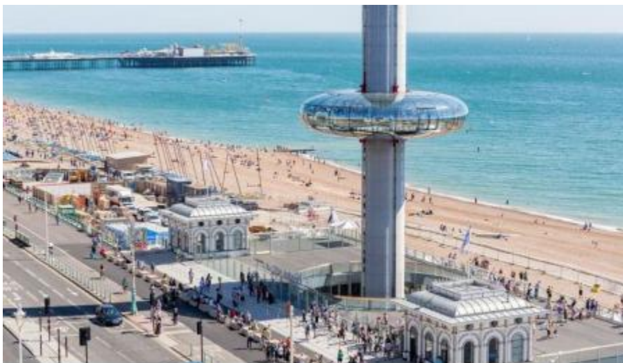
BAI360 Upper Deck Drone View