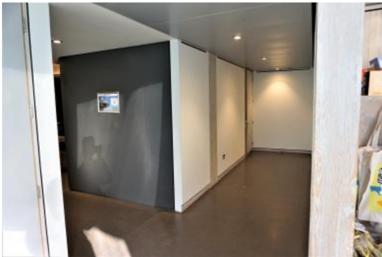
Disabled toilets are located to the right