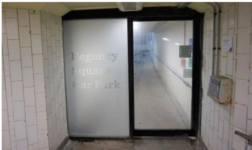
Regency Car Park inside access door

https://www.brighton-hove.gov.uk/content/parking-and-travel/parking/regency-square-car-park