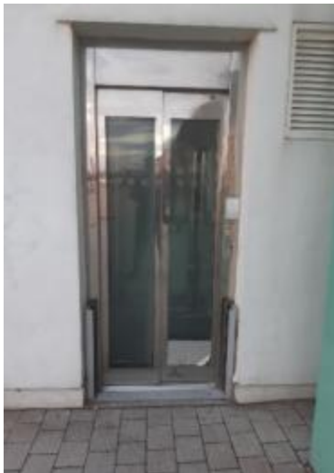
Lift beach level