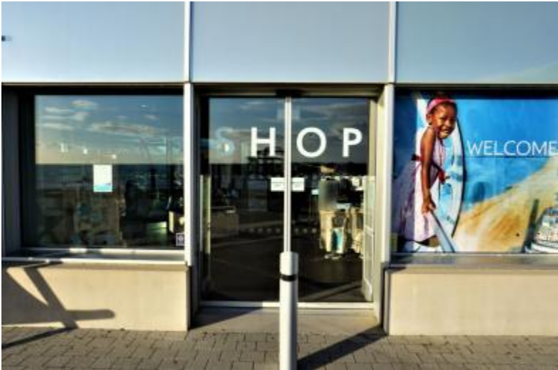
Retail Shop Main Entrance