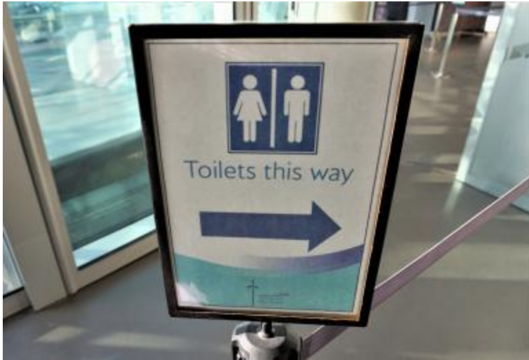
Toilet sign at a low level