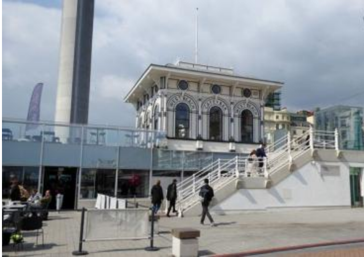
West Beach Bar & Cafe - View from Beach Level