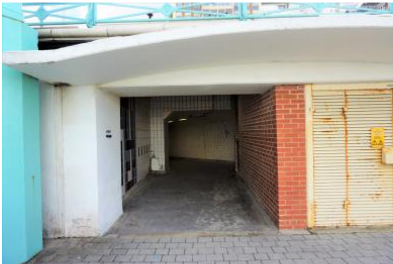
Regency Car Park ramp on beach level