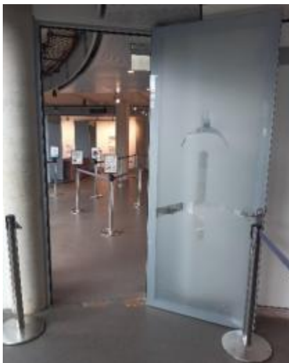
Contract markings on open boarding door