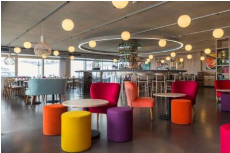
West Beach interior