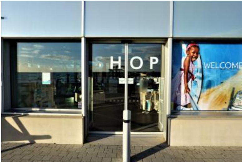
Contrast markings on glass entrance doors