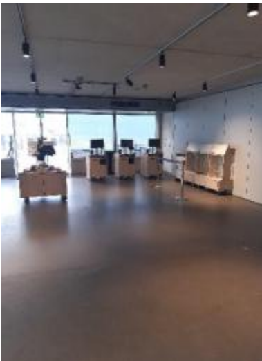
View inside gift shop West