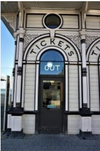
Main entrance - Ticket Office OUT door closed