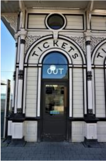
Ticket Office Street Level Access - OUT Door Open