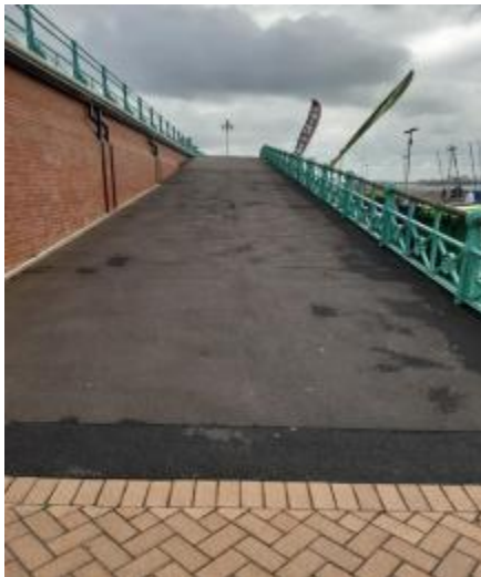
Ramp access connecting beach level and street level