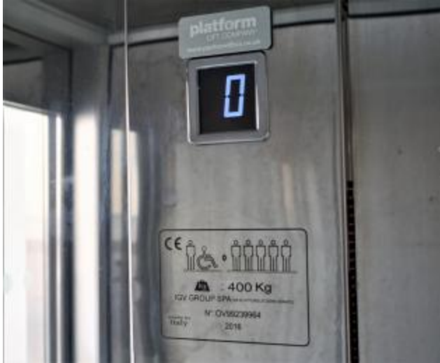
Inside lift - lift numbers