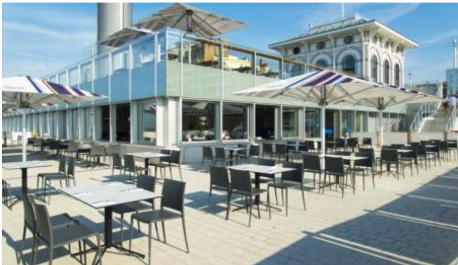
West Beach Bar & Kitchen Outdoor Terrace