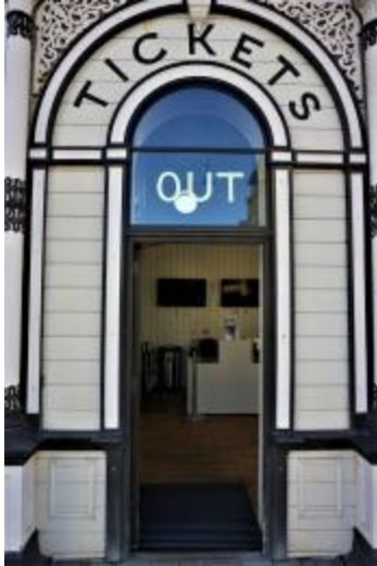
Main entrance - Ticket Office OUT door open