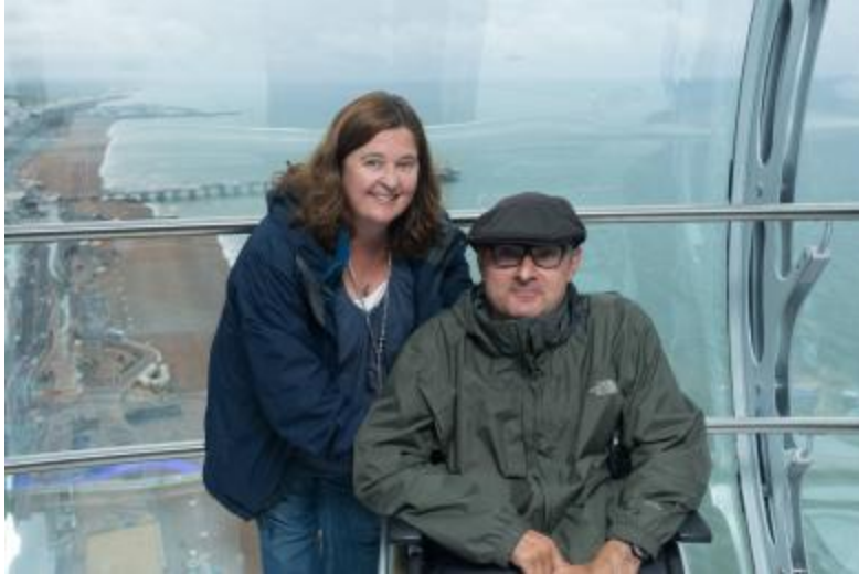
Wheelchair user on board BAi360 pod