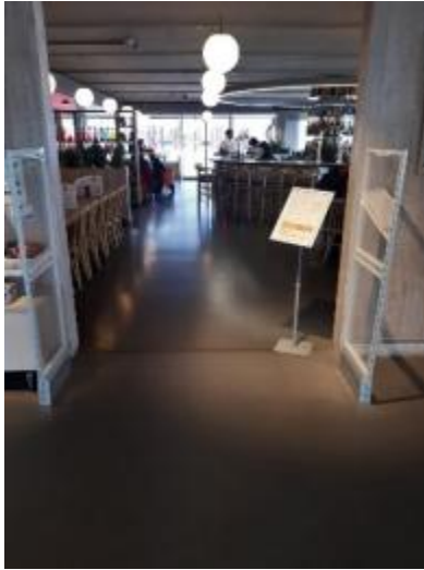
West Beach Entrance from shop to restaurant

The restaurant is table service and can be contacted to take bookings on 0333 800 1360.