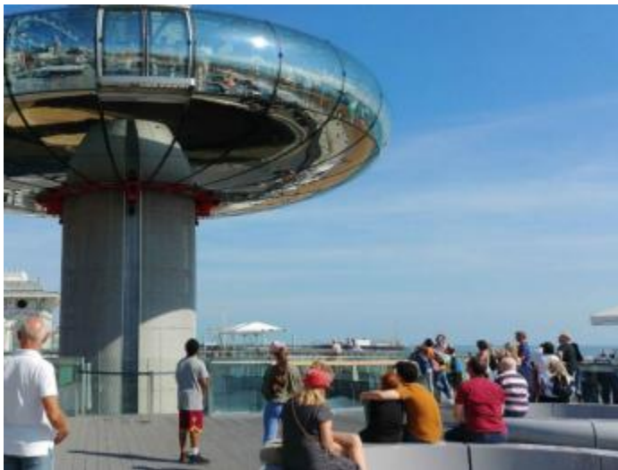
BAI360 Upper Deck Interior View