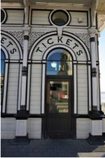
Main entrance - Ticket Office IN door closed