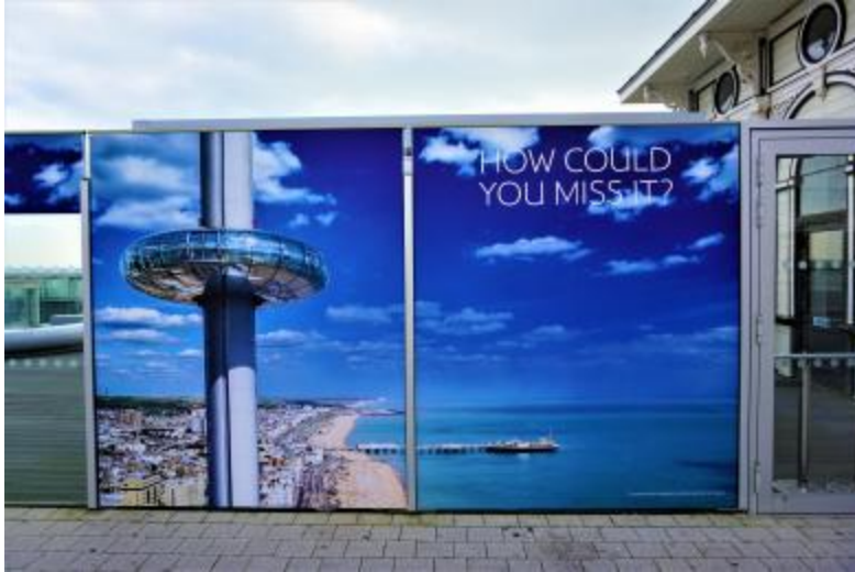
BAI360 Upper Deck Exterior View