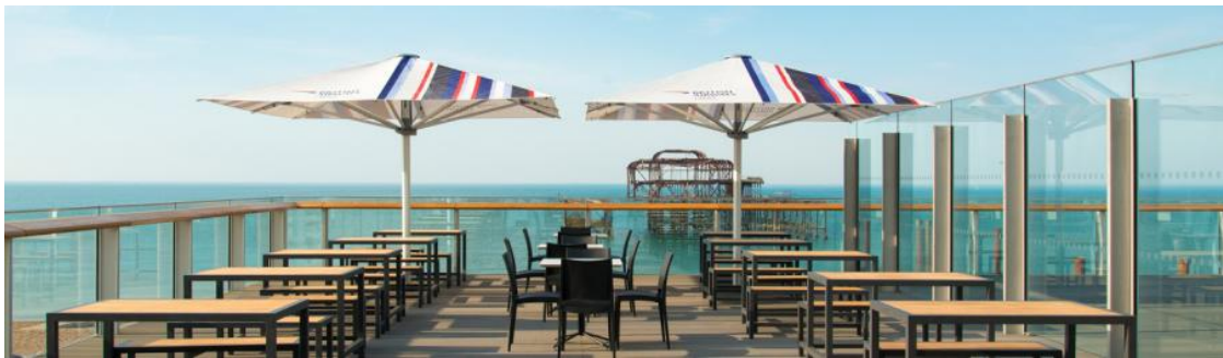
West Beach Bar & Cafe - Upper Deck outdoor seating area