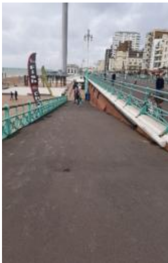
Ramp access connecting beach level and street level