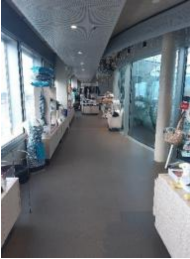
Inside gift shop