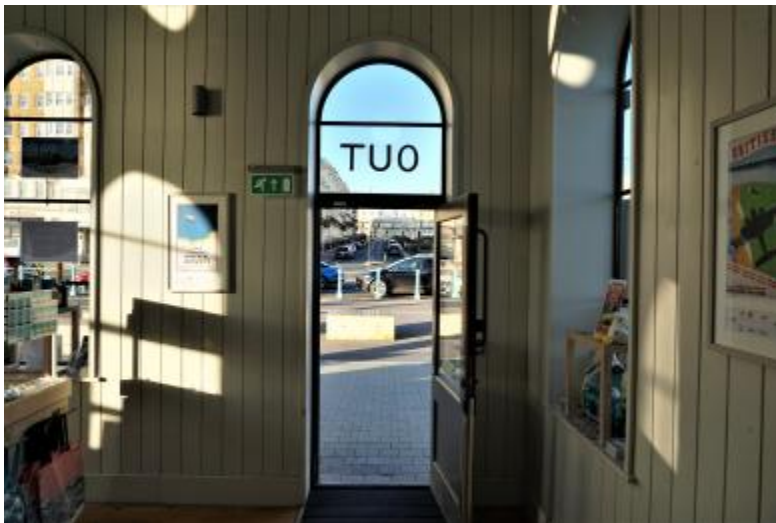
Main entrance - Ticket Office OUT door open inside view