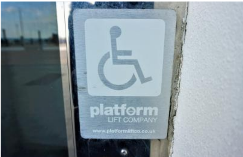
Platform lift company