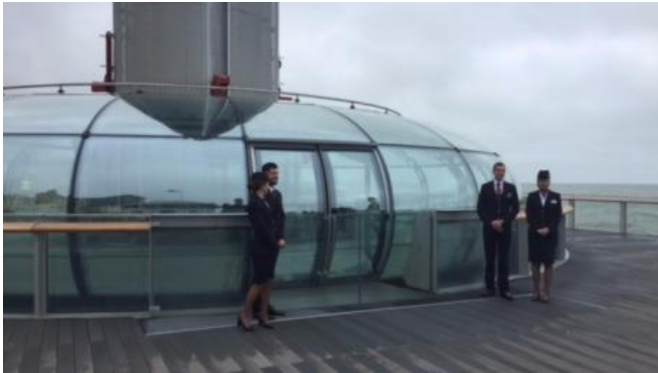
Pod door upper level