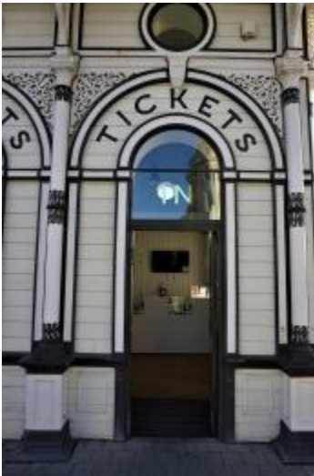
Main entrance - Ticket Office IN door open