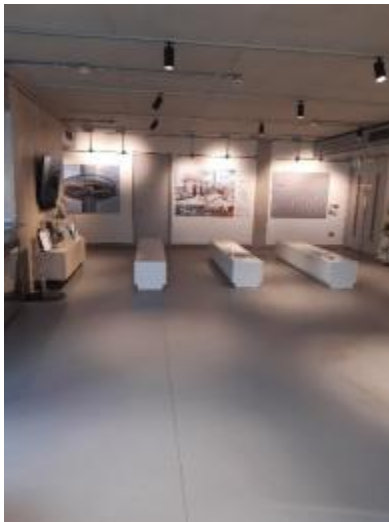
Pre-Boarding Bar Area