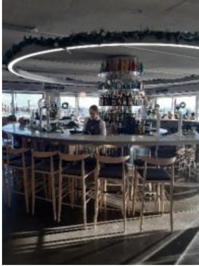
West Beach Bar