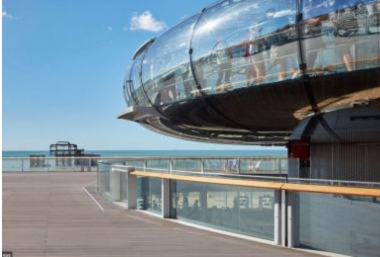
BAI360 Upper Deck Interior View