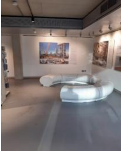
Pr-boarding Exhibition area