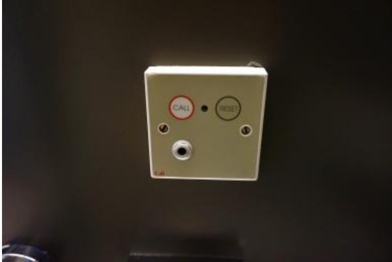
Buttons and assistance chord for customers