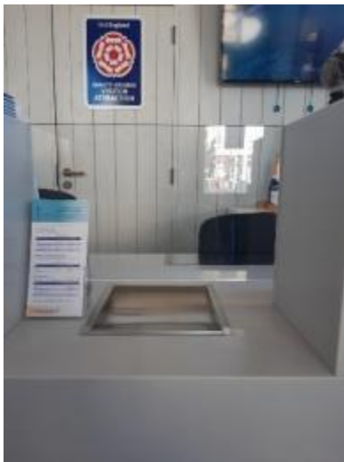
Ticket office desk - Low point for wheelchair users