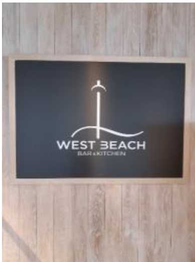
West Beach logo