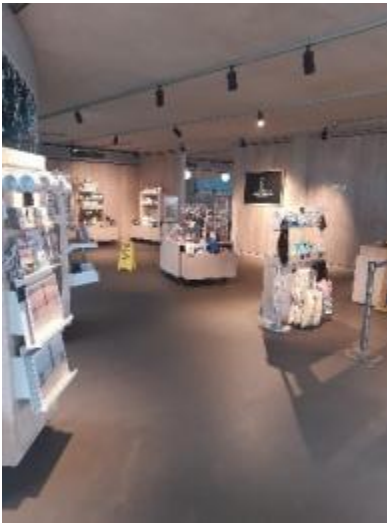
View inside gift shop East