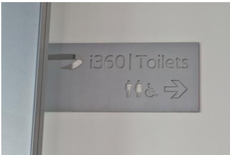
Toilet sign mounted to wall